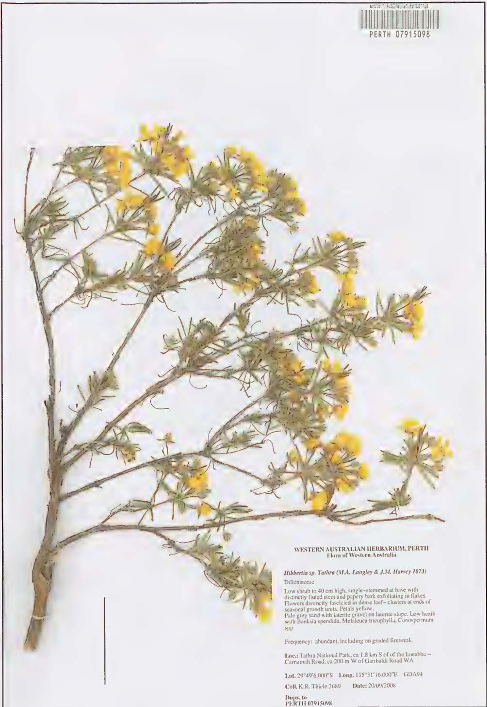
Figure 3. Holotype of Hibbertia fasciculiflora . Scale bar = 5 cm.